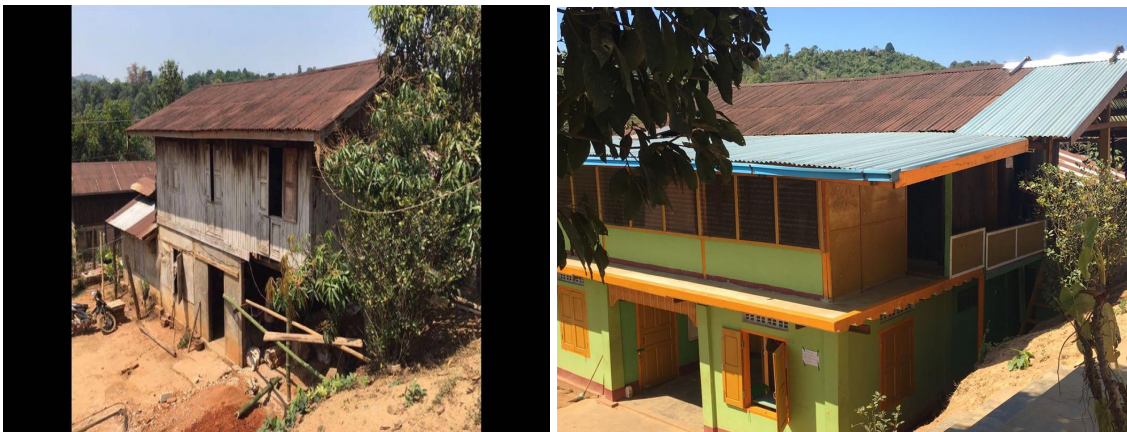
Before and after

Before her departure, she visited the new youth hostel funded by the donation she helped raised last year. The hostel is located at Leik Tho, two-hour drive from Toungoo, in the mountains. She met around 20 students and had lunch with them. The students had never met any foreigners before that they were too shy to make any eye contact with Debbie.