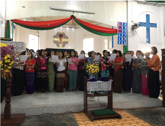
English service at St John the Baptist Church