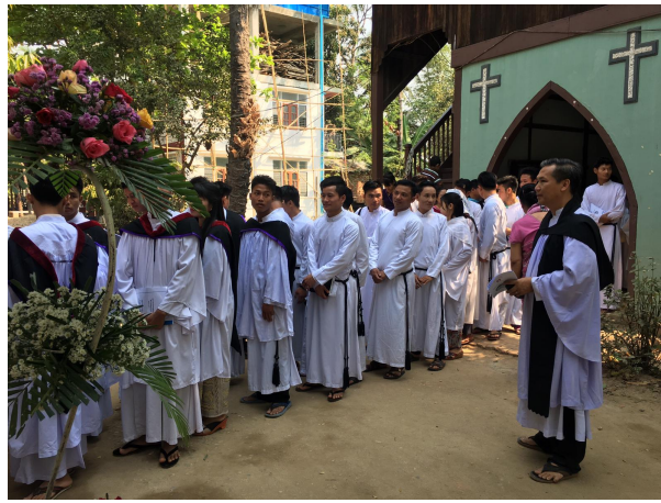
Preparing for the graduation