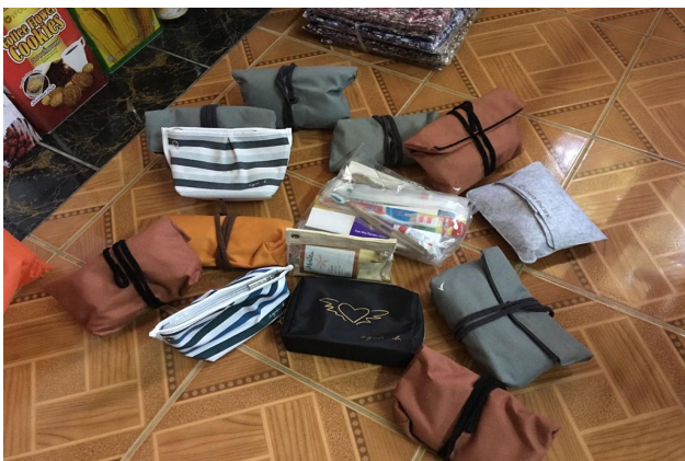
The toiletries will be presented as gifts to the locals.