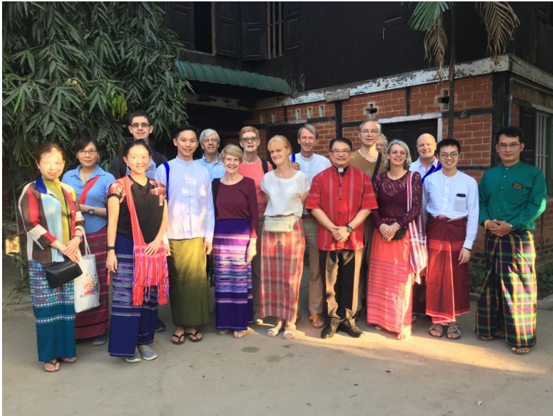
Day 3: Group dinner at the Bishop's official residence

This was the programme of the celebration events that the group attended