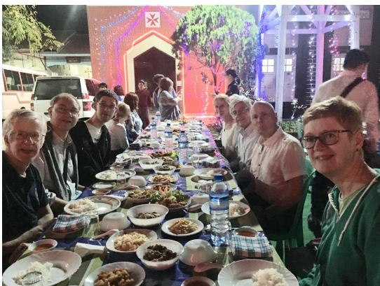
Team dinner at St John the Baptist Church