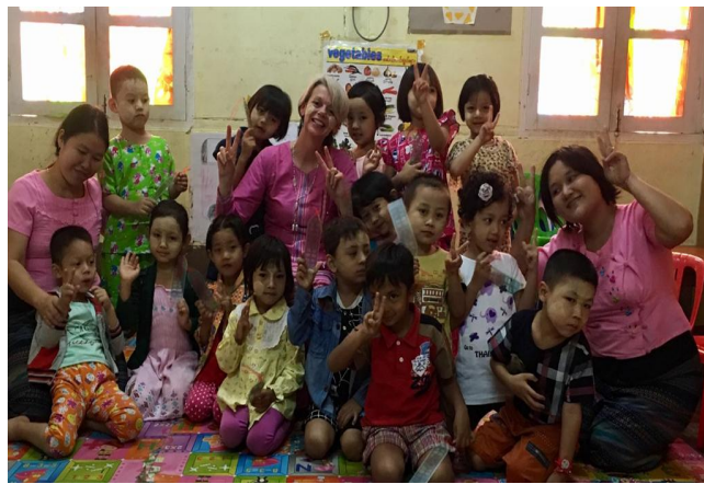
Saying goodbye to the pre-school children and the teachers ...