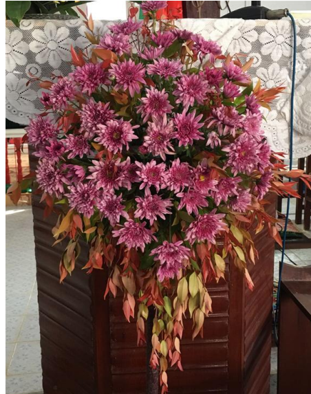
The altar and the flowers