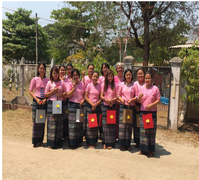
Her students love these gifts.