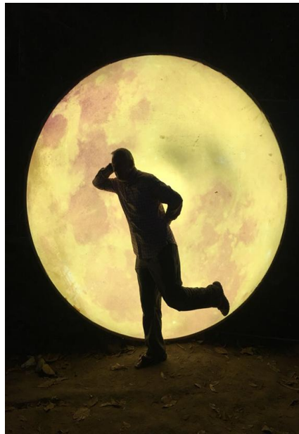
Toungoo Light Show