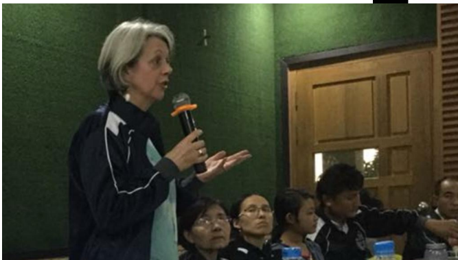
The Diocesan staff retreat