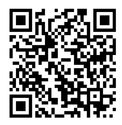
Online Donation in support of "Act of Love"

https://donation.skhwc.org.hk/hk/fund-donation/Act-of-Love