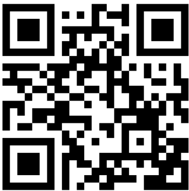
Online Platform for Making Appointment https://bit.ly/aolsupport_skh