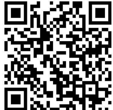
Online Donation in support of "Act of Love"

https://donation.skhwc.org.hk/hk/fund-donation/Act-of-Love