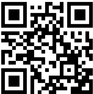
Online Platform for Making Appointment