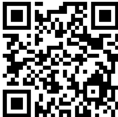
Volunteer Registration Form