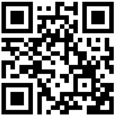
Online Platform for Making Appointment https://bit.ly/aolsupport_skh